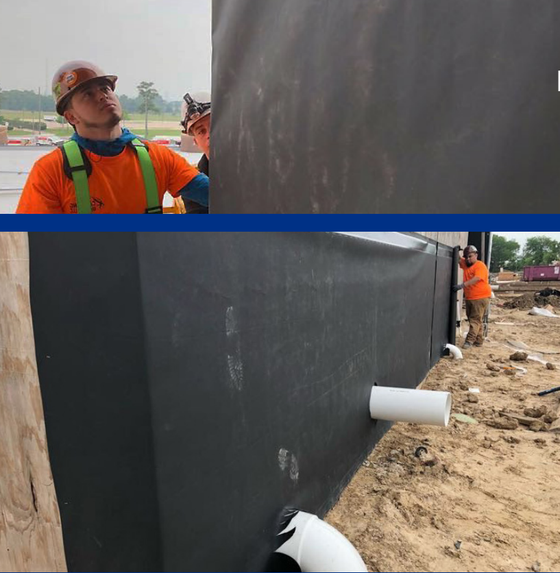
Once the installation was complete, Exterior Solutions USA finalized the job with an owner-performed QA inspection.