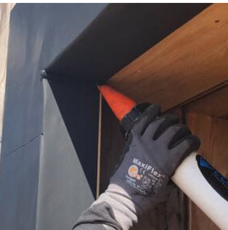
Exterior Solutions USA installed RevealFlashing SA Self-Adhered around the building's many rough openings, with Vapro-SS Flashing and VaproBond applied over top.